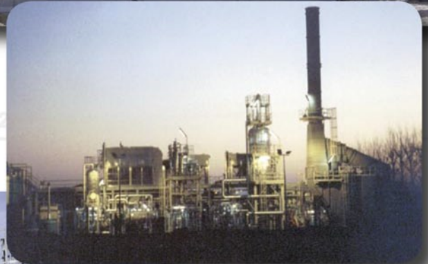
Waste Oil Recovery Unit

For more than 25 years Propak has demonstrated added value and single source responsibility to our customers - compression, power generation, gas dehydration, sweetening, sulphur and liquids recovery, oil treatment and desalination, distillation and fractionation - it's about proven performance and commitment to our customers - it's about added value!