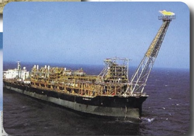
150,000 BPD Oil Processing System on FPSO vessel