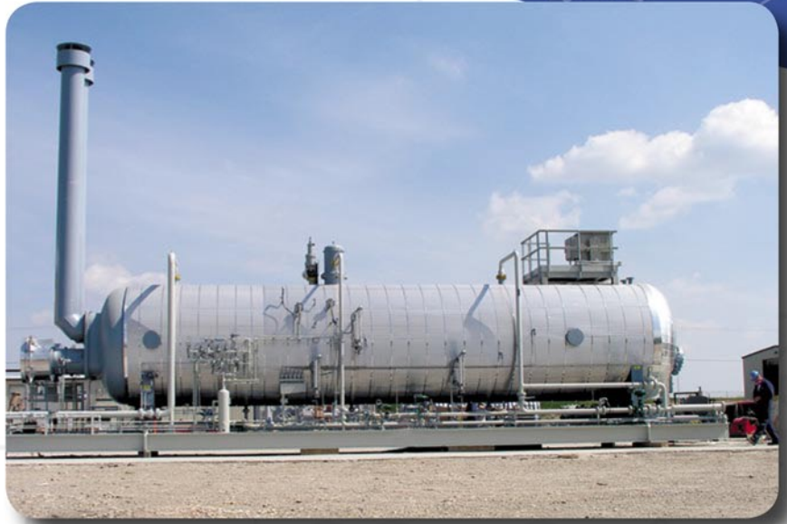
26,000 BOPD Electrostatic Heater Treater