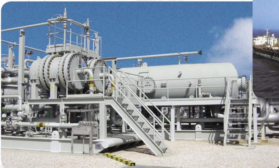
Hydrocyclone Packages 100,000 BWPD each