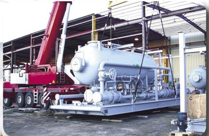
High Pressure Process Separators