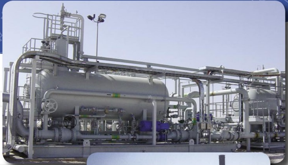
140,000 BWPD Separators